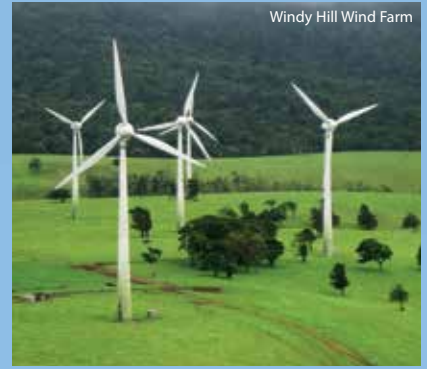
Windy Hill Wind Farm