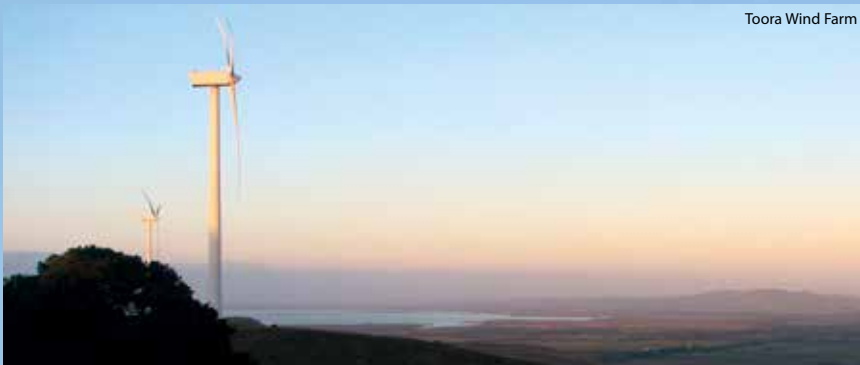
Toora Wind Farm