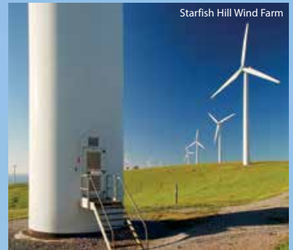
Starfish Hill Wind Farm