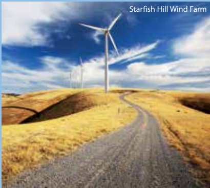
Starfish Hill Wind Farm