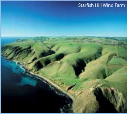
Starfish Hill Wind Farm