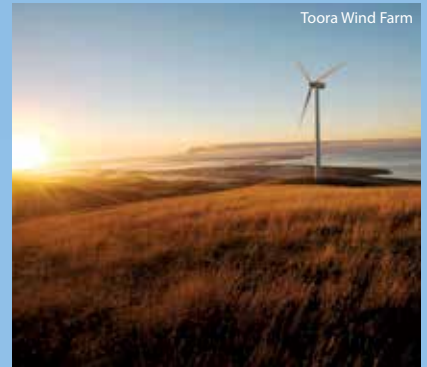
Toora Wind Farm