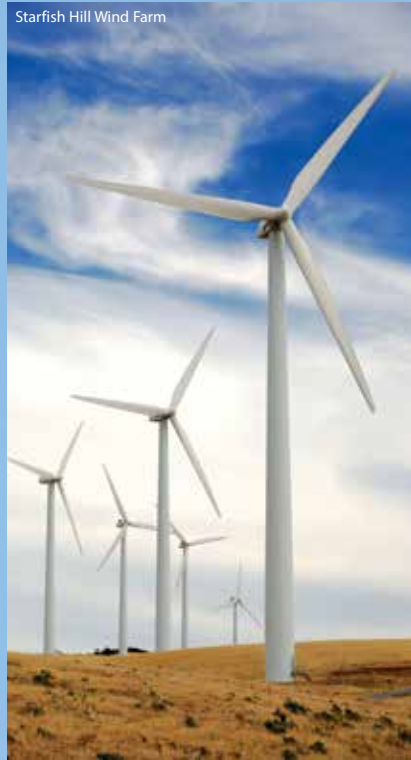
Starfish Hill Wind Farm